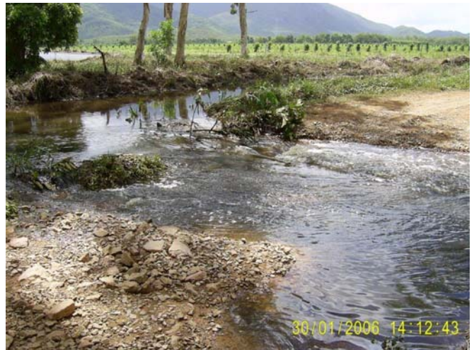
Figure 8: Water draining from cattle paddock into Reed Beds Lagoon on 30/1/06