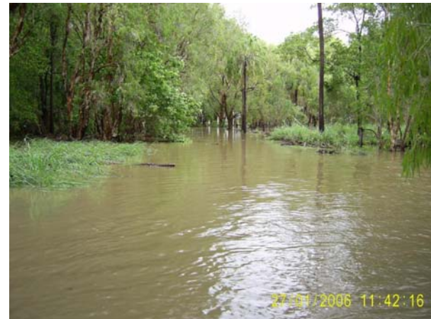
Figure 6: Water flooding into Reed Beds Lagoon across a wide area on 27/1/06