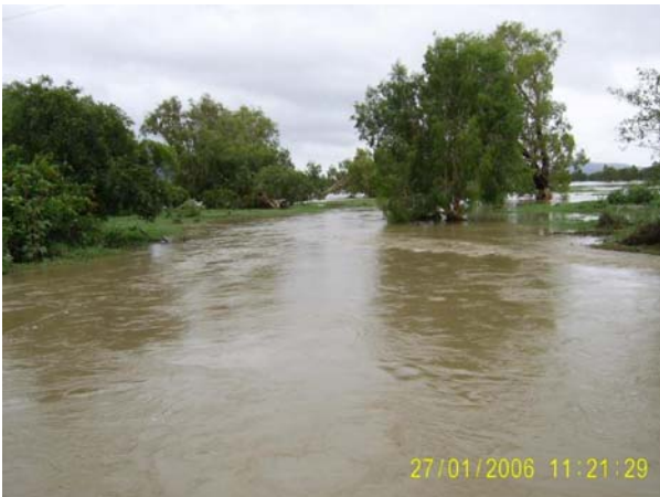
Figure 5: Turbid water flowing downstream from Healey's Lagoon on 27/1/06