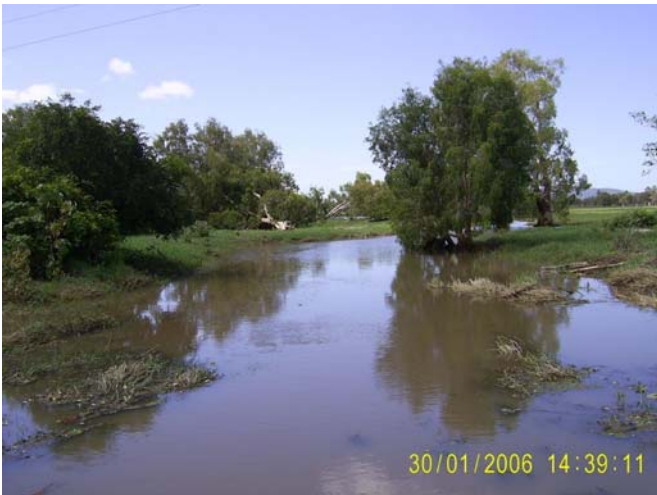
Figure 7: Reduced water flow across cattle paddock downstream from Healey's Lagoon on 30/1/06