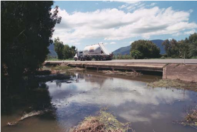
Figure 3: Highway culvert downstream from Healey's Lagoon