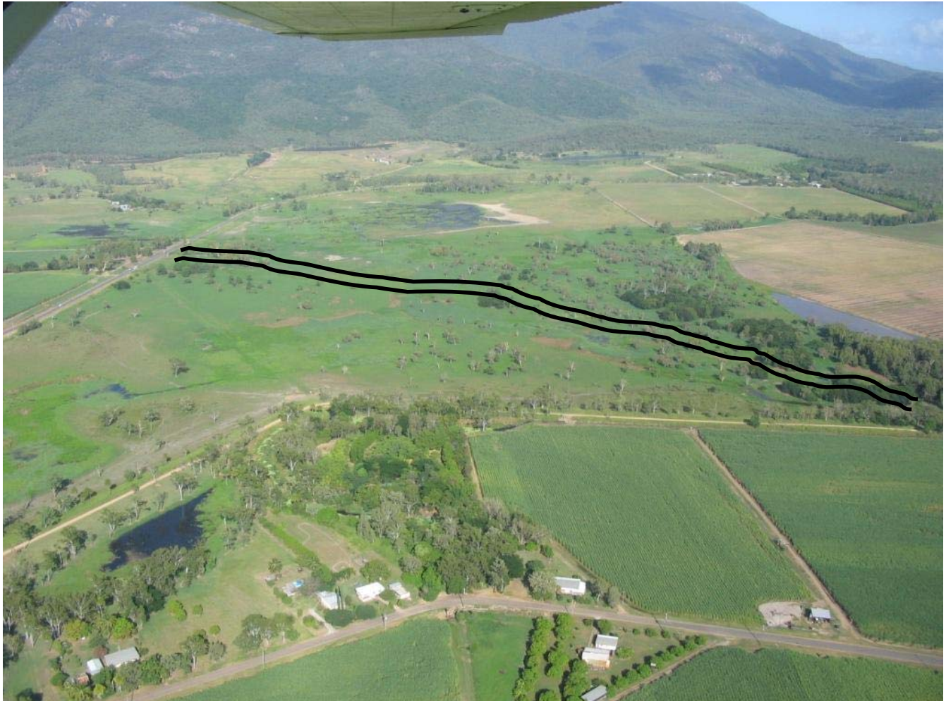
Figure 9: Approximate proposed course of channel across cattle paddock