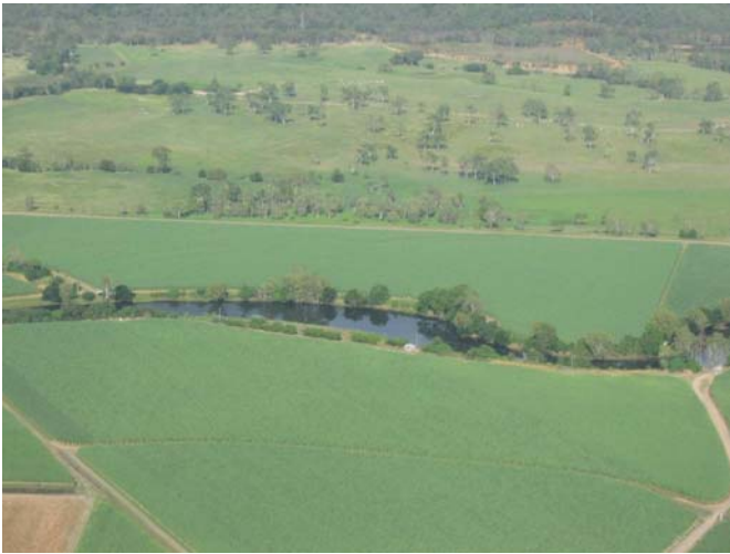
Figure 1: Middle section of Healey's Lagoon