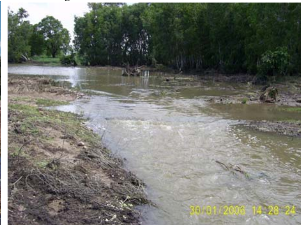
Figure 4: Outlet to Healey's Lagoon showing restricted fish passage on low flows